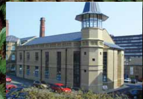
The Methodist Mission, Huddersfield town centre, made from local stone.

The woodlands' owners have welcomed the opportunity to increase public access to the woods. The quarrying undertaken in the recent past has made a real contribution to the local economy in the provision of stone and aggregates making this industry one of the last remaining strongholds of manufacturing in this area.