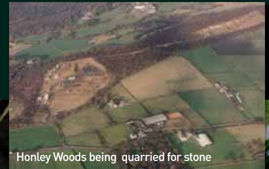
Honley Woods being quarried for stone

Honley Woods is one of West Yorkshire's largest remaining ancient semi-natural woodland areas. Covering 60 hectares (150 acres), it is an important example of upland oak woodland and is a key part of the local forest habitat network.