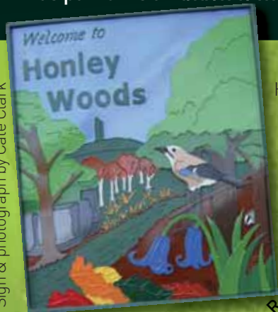
Sign & photograph by Cate Clark

Kirklees Council aims to widen participation and access to the countryside as part of its ambition to make Kirklees a beacon for green living.